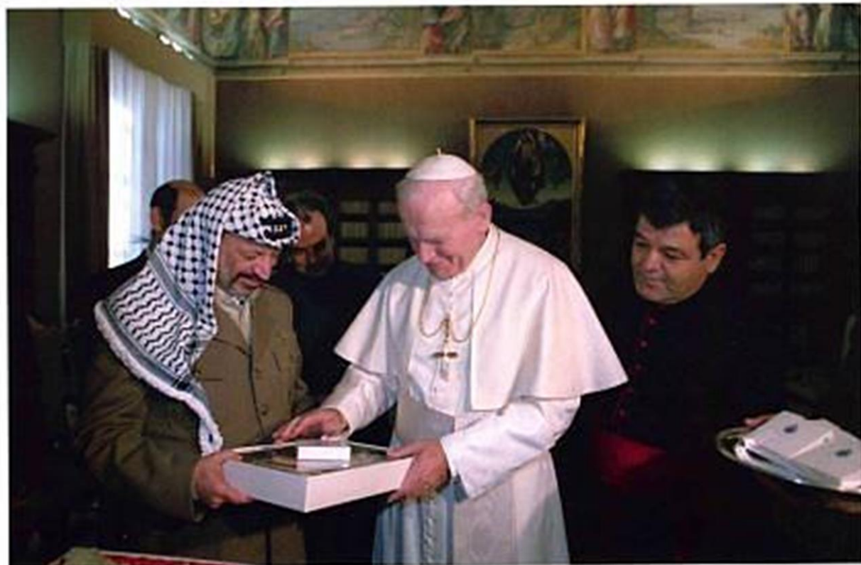
Historic meeting between H.H. Pope John Paul II and late President Yasser Arafat, Vatican City, Holy See - 23/12/1988

By 1988, His Holiness Pope John Paul II had received the late President Yasser Arafat a second time, reiterating his support for peace through dialogue and a solution guaranteeing the rights of the Palestinian people.