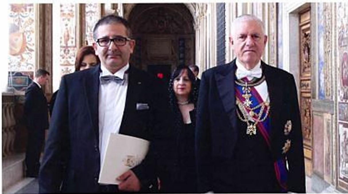
His Excellency Ambassador Issa Kassassieh during credentials ceremony, Vatican City, Holy See - 12/12/2013

On 12 December 2013, Mr. Issa Kassassieh became the first Palestinian Ambassador to submit his credentials to His Holiness Pope Francis during an official ceremony of accepting credentials for Ambassadors of other states. The ceremony reflected the progress achieved in the bilateral consultations to reach a comprehensive agreement between the Holy See and the State of Palestine.