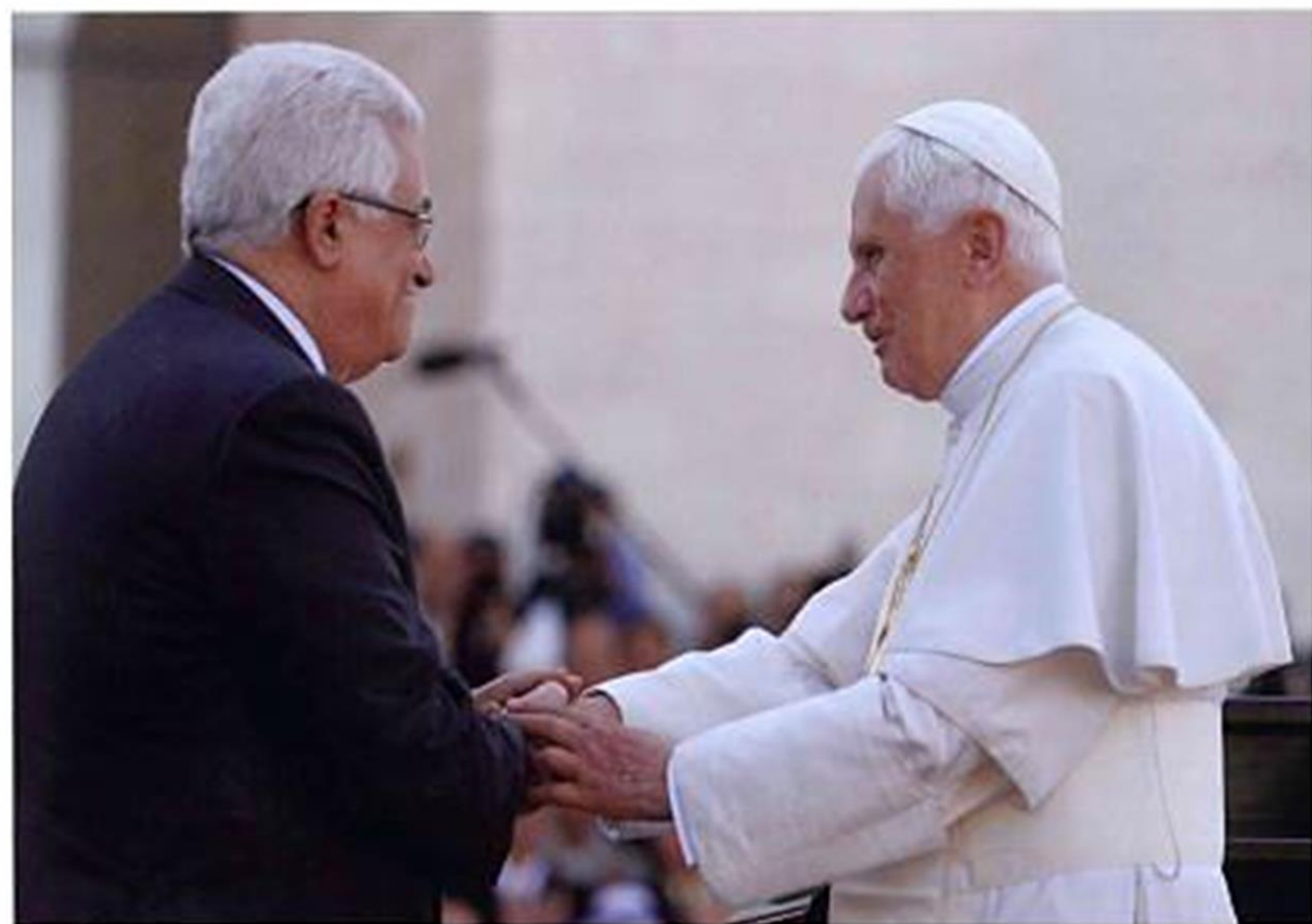
President Mahmoud Abbas greeting H.H. Pope Benedict XVI at the Presidential Compound, Bethlehem, Palestine - 13/05/2009