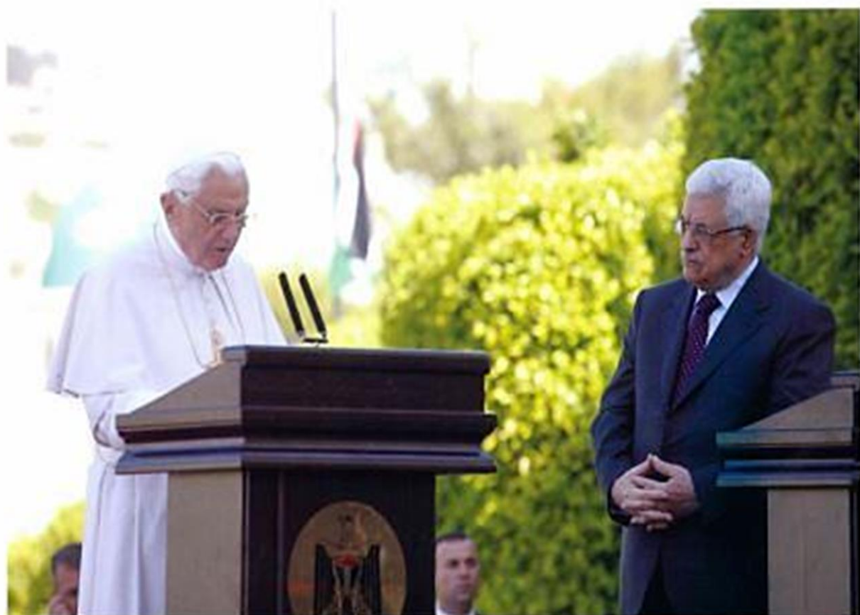
H.H. Pope Benedict XVI delivering speech during reception by President Mahmoud Abbas at the Presidential Compound, Bethlehem, Palestine - 13/05/2009